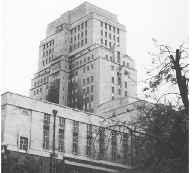
« Patiesības Ministrija » Ēka, kurā Orvela laikā (kara laikā) atradās Britu informācijas ministrija

Instantly his face turned scarlet and the water ran out of his eyes. The stuff was like nitric acid, and moreover, in swallowing it one had the sensation of being hit on the back of the head with a rubber club. The next moment,