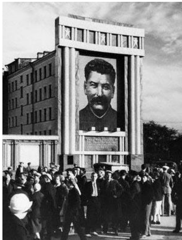
PSRS realitāte Orvela laikā

The Ministry of Truth contained, it was said, three thousand rooms above ground level, and corresponding ramifications below. Scattered about London there were just three other buildings of