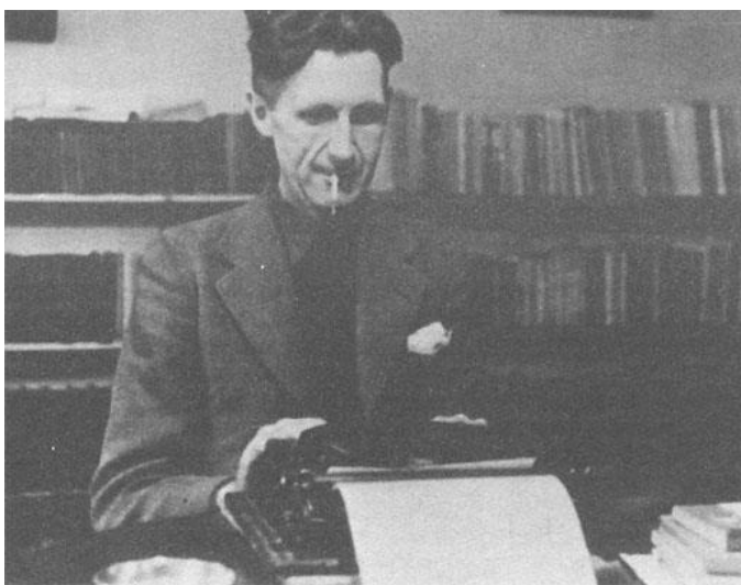
Orvels raksta 9

Some of Orwell's Newspeak vocabulary ( Newspeak itself, Big Brother , doublethink ) has entered the English language; certainly his vision of a drab totalitarian future has entered the general consciousness, although it is difficult to know whether his warning has been fully understood. He warned of a possibility for the future, to be resisted, rather than an inescapable fate. Orwell always attempted to describe political reality as he saw it. As he wrote at the time he was working on Nineteen Eighty-Four . "Most of us have a lingering belief that every choice, even political choice, is between good and evil, and that if a thing is necessary it is also right. We should, I think, get rid of this