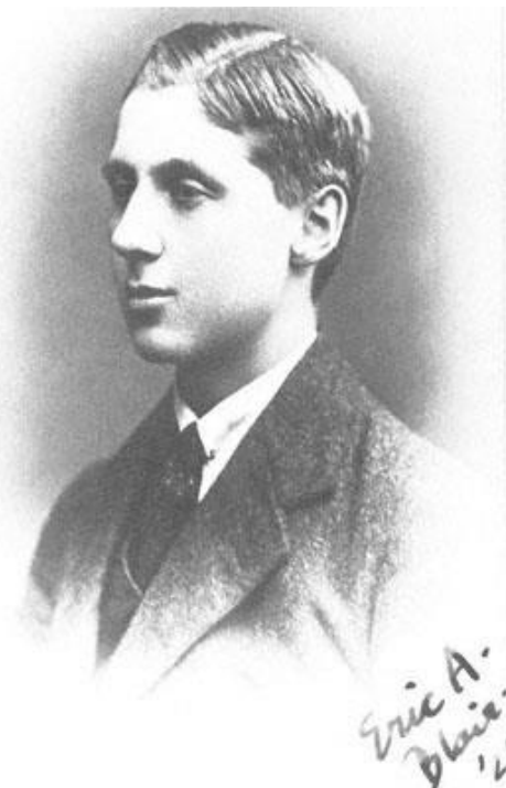
Orvels (Eriks Arturs Blērs) jaunībā (Ītonas koledžu beidzot)

During World War II Orwell worked for the BBC producing programmes for India and South East Asia 4 , and as manager of a bookshop, as well as producing a lot of journalism. This was mainly on political subjects, but he also wrote articles about everyday wartime life in London and a considerable amount of literary criticism. During this time he began to plan Nineteen Eighty-Four , 5 before he started to work on Animal Farm , which was published in 1945.